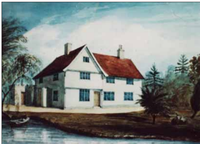
Athelington Hall painted by Davy in 1840. This picture hangs in British Museum. Many thanks to Peter Havers.

to one village or go by car four miles to another. We did the latter picking up children all along the way.