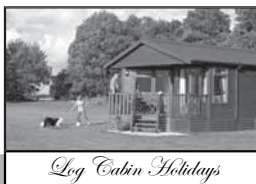
Log Cabin Holidays