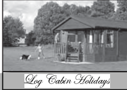
Log Cabin Holidays