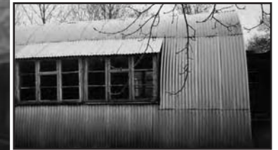
Before & After: The Red Feather Club at Horham Airfield 1981 (left) and 1991 (above).

A new group was formed called Horham Airfield Heritage Association, which had their first open day in October 2000. The group had support from the local council to publicise the former airfield to tourists and The Red Feather became a visitor attraction.